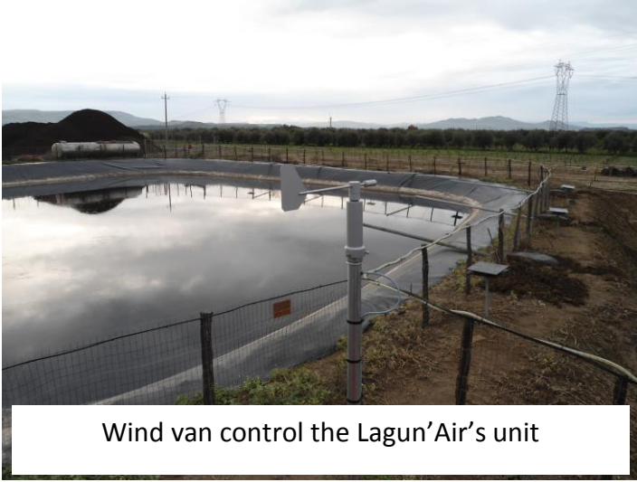
Wind van control the Lagun'Air's unit