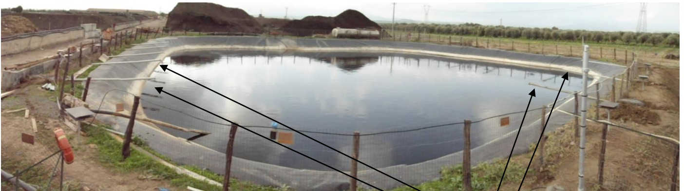
Big lagoon treatment – cans with nozzles