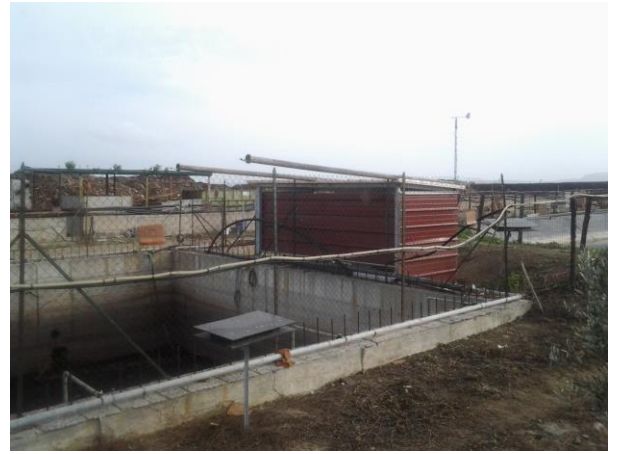
Small lagoon treatment